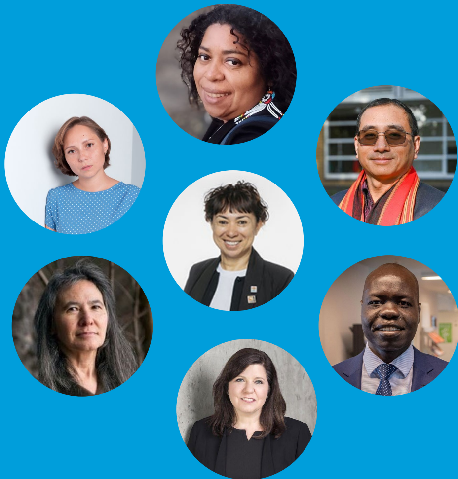
Current Experts Members 2024-2027