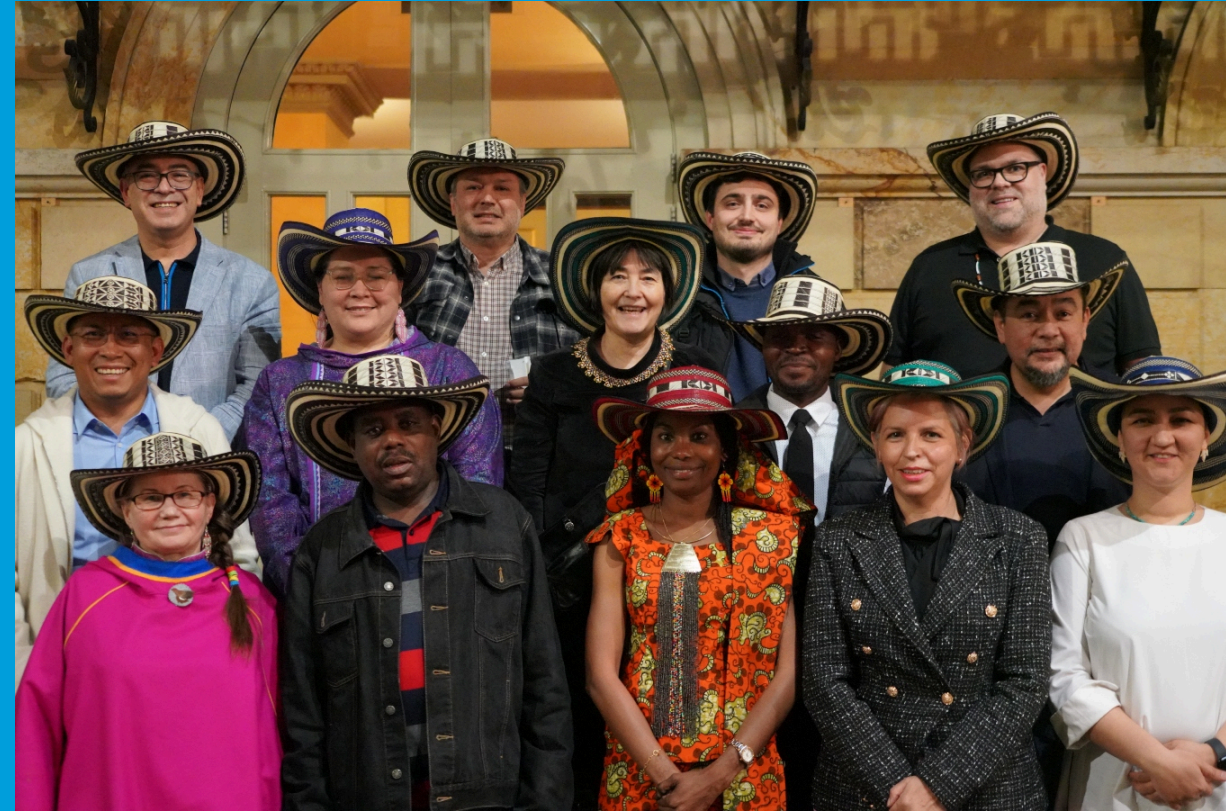
Current 16 UNPFII Members